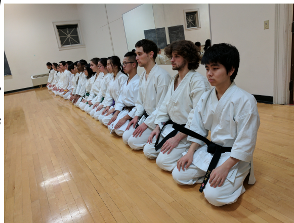
MJKC going strong — spring 2017